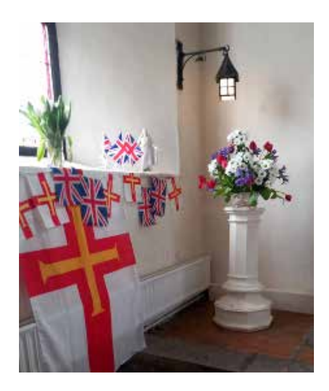
Jane - 2023